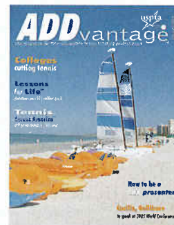
On the cover ... Marco Island, Fla.