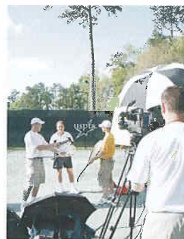
On the cover ... USPTA's staff prepares to shoot another episode of "On Court with USPTA™."