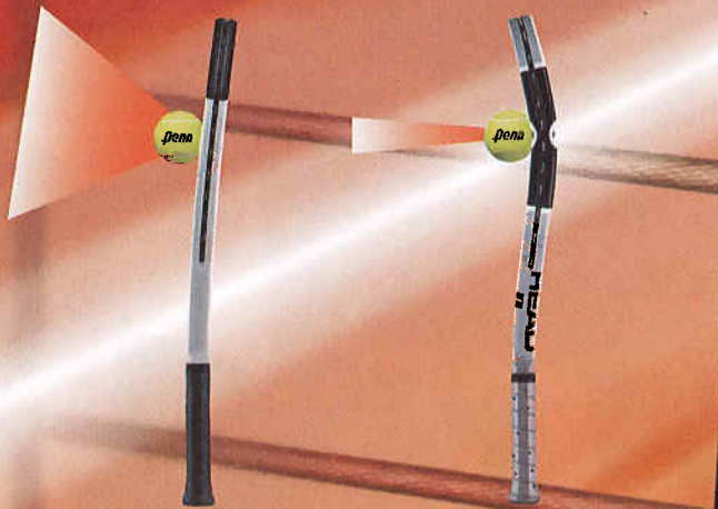
Conventional Racquet: Lack of Control.

Experience a new world of control with no loss of power. Real Technology. Real Benefit.