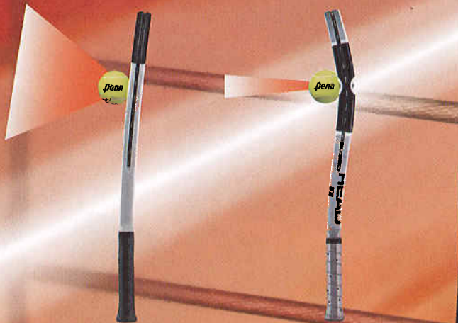
Conventional Racquet: Lack of Control.

Experience a new world of control with no loss of power. Real Technology. Real Benefit.